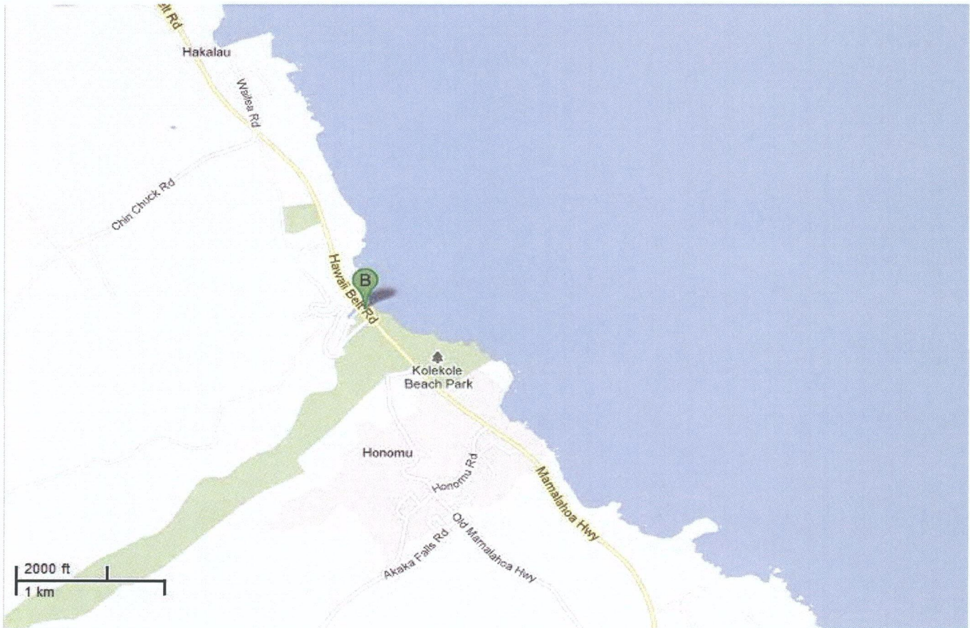
001000190308549 Kolekole Stream Bridge