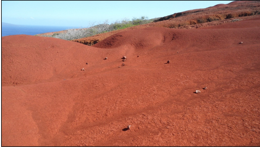
Figure Site 540 in the Project Site